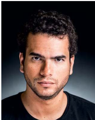
Artur Avila (Universität Zürich, Switzerland)